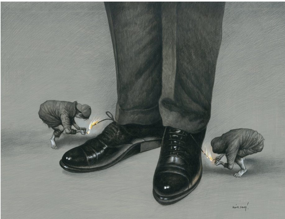
32nd Aydın Doğan Cartoon Contest announces winners - Click for the Photo Gallery