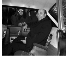
22 memorable quotes by iconic Turkish politician Süleyman Demirel