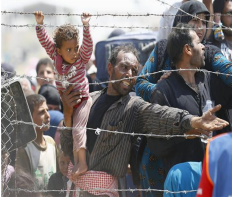
Dramatic images at Turkish border as Syrians flee ISIL